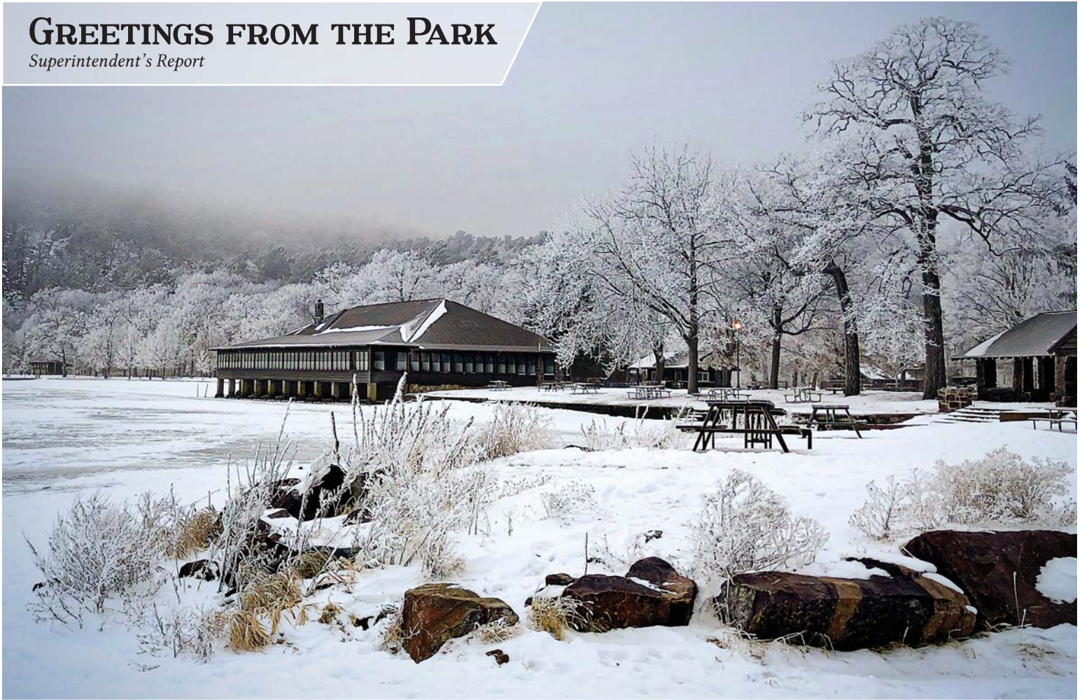
📷 Jim Carter, North Shore, circa January 5, 2021

Although it seems as if winter is a quieter time of year to visit the park, staff are in full swing working towards preparing the property for the return of the masses. Devil's Lake has more than a record number of park visitors to contend with each year. During the winter months most of the repairs are made to the 1,200 picnic tables that are scattered across the campsites and picnic areas. Friends Group members and volunteers help stain and stack new boards throughout the warmer months, while park staff inventory, identify and replace the boards and bolts of seats and tabletops. Each picnic table is inspected by staff twice each year and either passed over for continued use or pulled from service to await further repair. Campground hosts also serve as inspectors in the campgrounds as they make their rounds cleaning ash from each of the campfire rings throughout the camping season.