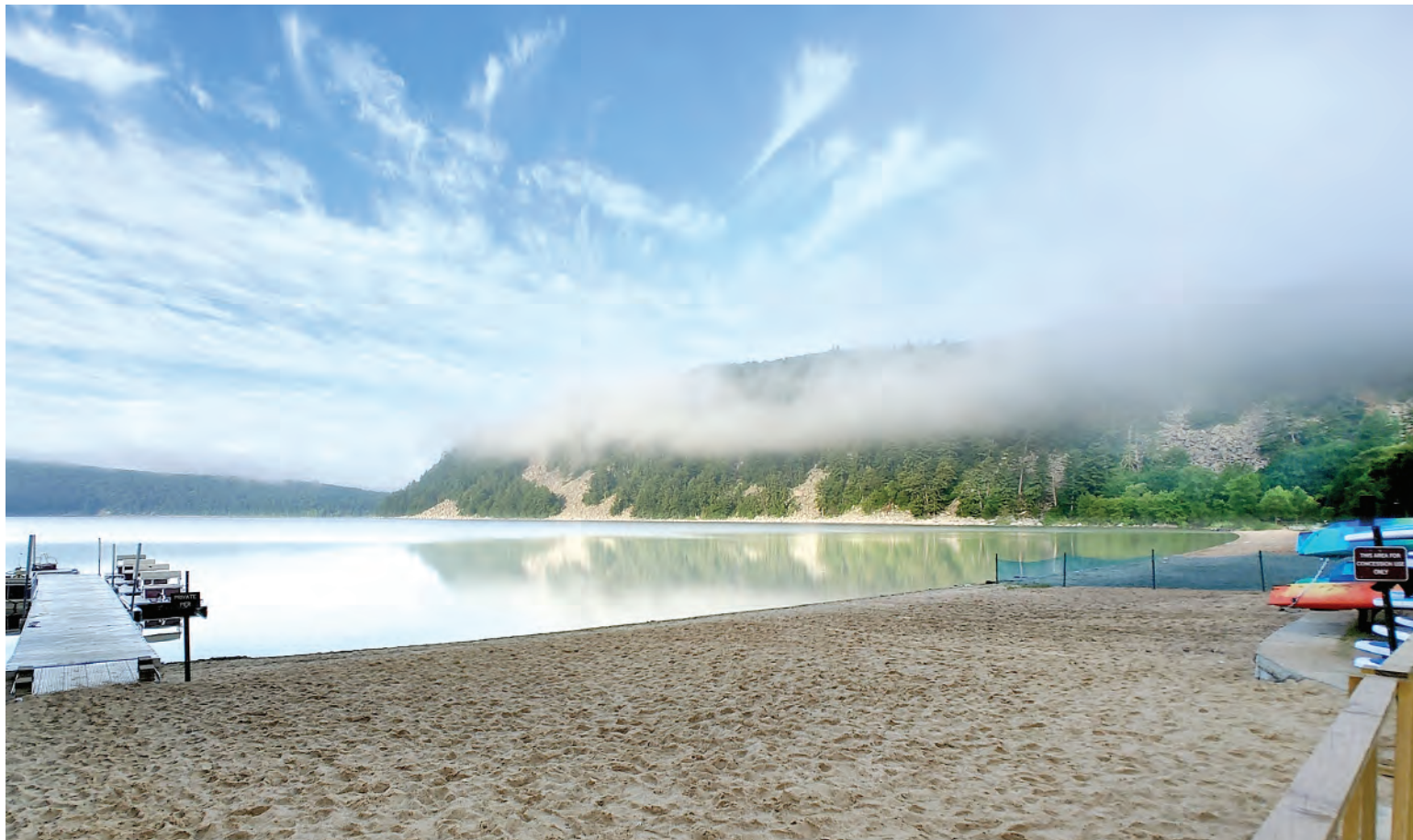
North Shore Fog