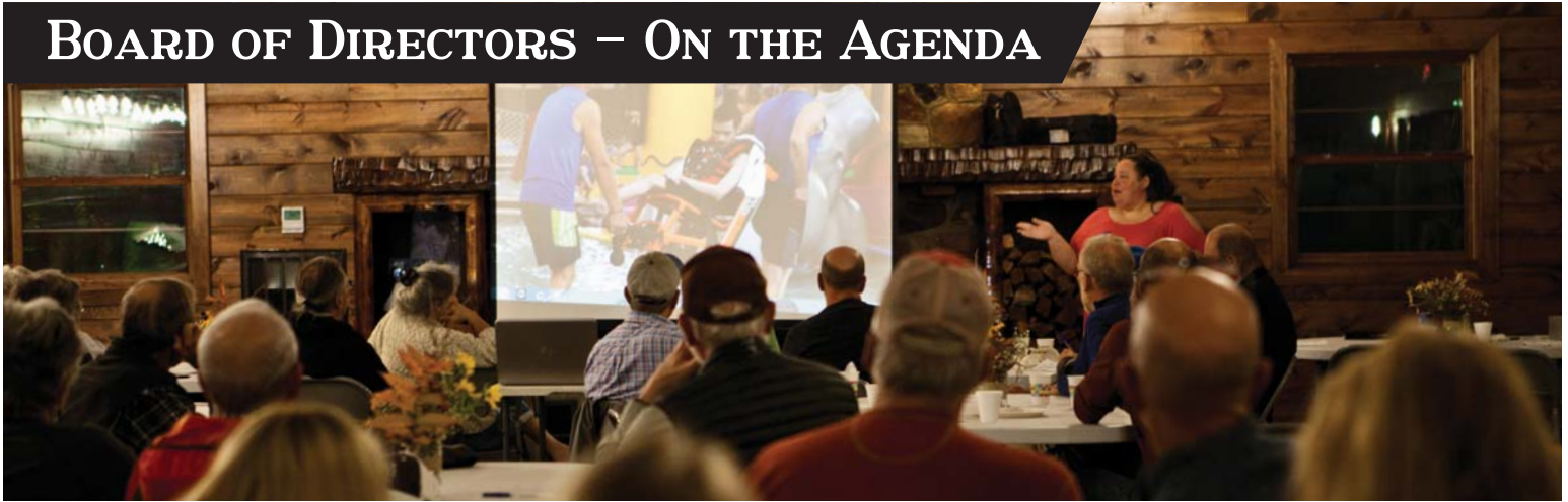
📷 Assist WI presenting at the Annual Member Meeting 09-29-19