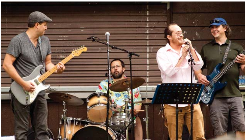
Madtown Mannish Boys, August 25, 2019